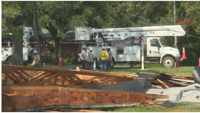
▶ Microburst hits West Monroe, hundreds lose power