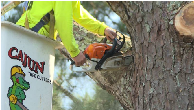
▶ West Monroe tree cutters to help in Ida recovery.