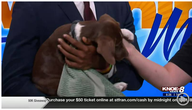
Adopt a Pet!