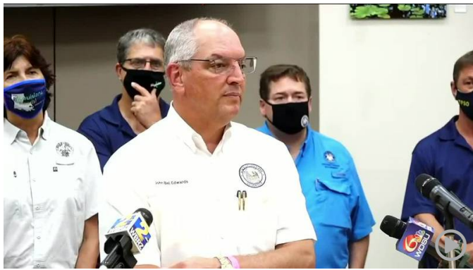
Gov. Edwards speaks in Tangipahoa Parish