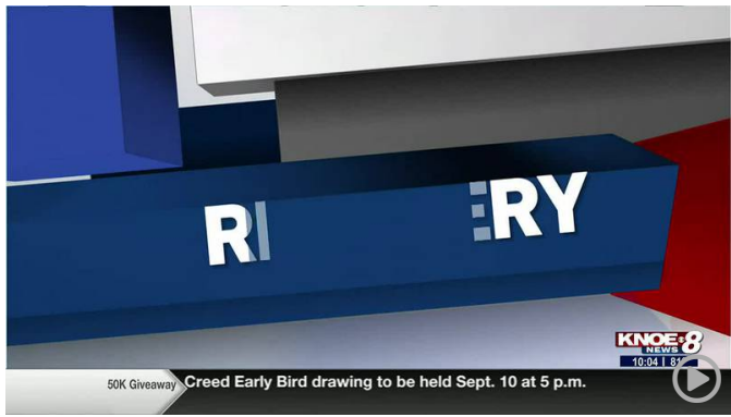
West Monroe tree cutters to help in Ida recovery.